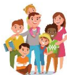
Year 6 Parents & Carers

A warm welcome to our Transition Page for Year 6 students, and their parents and carers. We will be using this page to keep you informed and prepare you for starting at Bishop Luffa. You will receive weekly editions of Transition Tuesdays in the lead up to the Year 6 Transition Day. We can't wait to meet you in person!