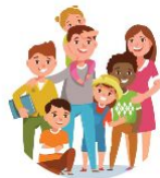
Year 6 Parents & Carers

A warm welcome to our Transition Page for Year 6 students, and their parents and carers. We will be using this page to keep you informed and prepare you for starting at Bishop Luffa. You will receive weekly editions of Transition Tuesdays in the lead up to the Year 6 Transition Day. We can't wait to meet you in person!